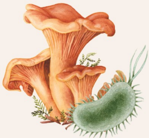
Champignons et bactéries