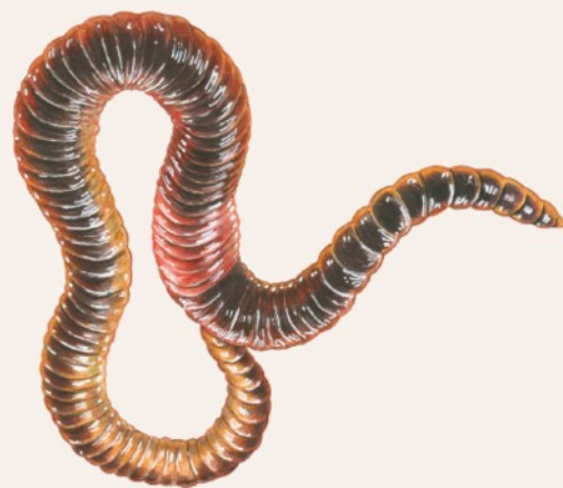
Vers de terre